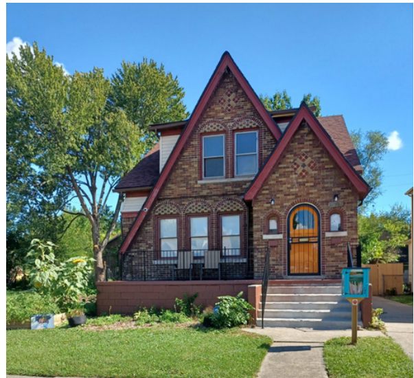
The Brilliant Detroit Morningside house.