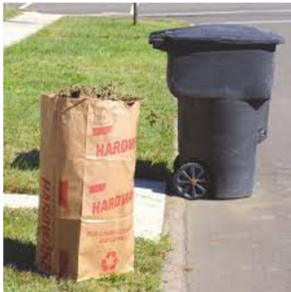
Courville Container.

Thursday, October 12 and 26 Thursday, November 9