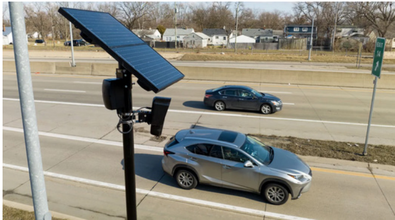
A camera License Plate reader

District 4 Councilwoman Latisha Johnson joined District 6 Councilwoman Gabriela Santiago-Romero last month to oppose the addition of 100 more license plate readers (LPRs) at 25 intersections in Detroit. Council approved the $5 million agreement with Motorola Solutions by a vote of 7-2.