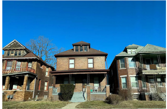
Overtaxation has left many Detroiters struggling to maintain their homes.