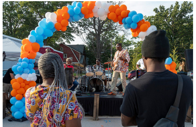
A performance at the Courville Plaza during the E. Warrenfest.