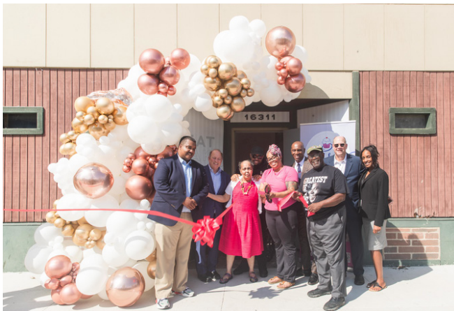
Terri's Cakes celebrate their ribbon cutting with Mayor Mike Duggan.

Several of the pop-up food vendors provided a preview of bricks-and-mortar establishments to come, including the award-winning East African restaurant Baobab Fare opening next year on E. Warren at Harvard, and Gajiza Dumplin's, an Asian restaurant that will have a home in The Ribbon development going up now at Kensington. Much to the disappointment of latecomers like me, Terri's Cakes, which had a popup in their storefront near Three Mile, had already sold out by 6 p.m. Their grand opening is planned for January.