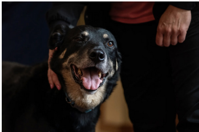
Scout the dog.