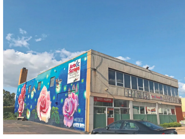
Arts & Scraps.

Whether you're looking to stock up on festive crafting supplies or just want to spread a little holiday joy, this sale is your chance! Don't miss out – hurry down to Arts & Scraps and make the most of these incredible savings. See you soon at the store!