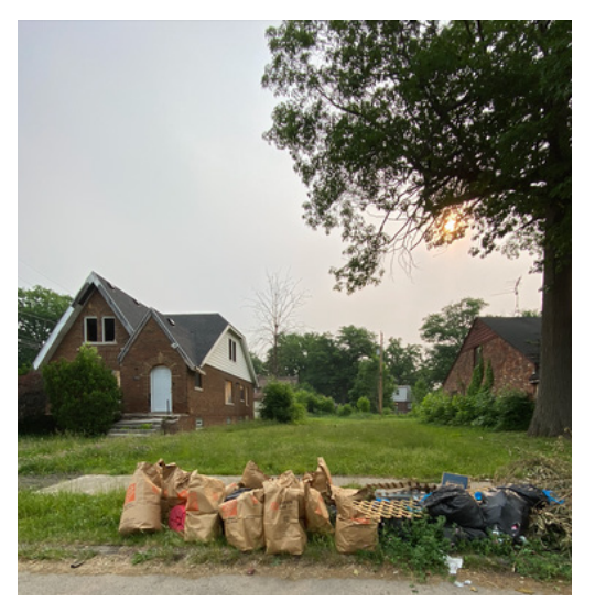
A variety of trash bags and other items sits on the berm.

Thursday, September 14 and 28 Thursday, October 12