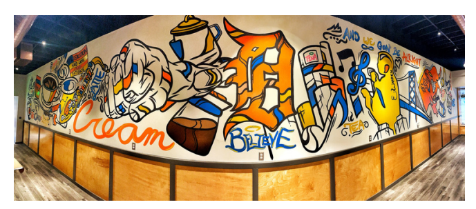
Morningside Cafe Dedication Pt. II mural.

So many of you completed the beautiful Dedication Pt. II mural which was commissioned by the extremely talented, Detroit-based artist, Trae Issac.