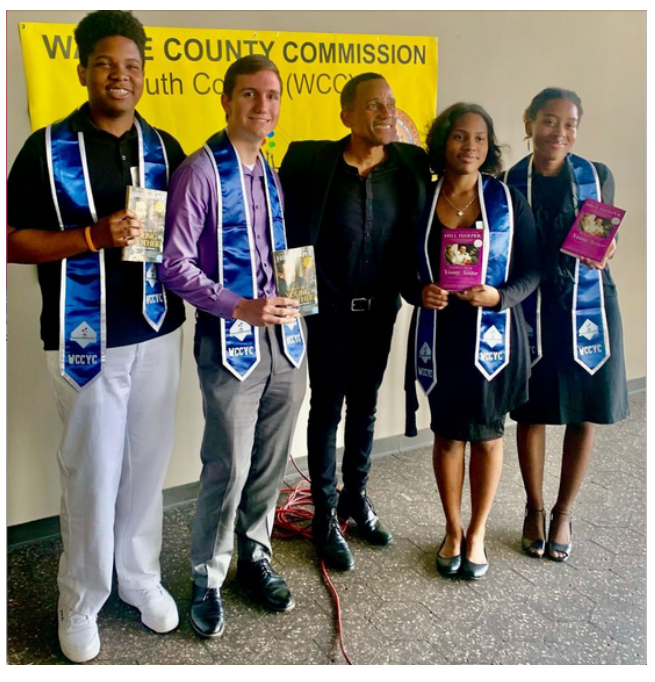
Wayne County Commission Youth Council members are joined by actor and Michigan U.S. Senate candidate, Hill Harper.

Applications are still open for the 2023-2024 Wayne County Commission Youth Council, but the deadline is coming up very soon – Friday, September 15 at 5 p.m. Read more about the position and how to apply.