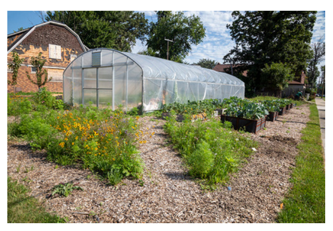
The hoop house is one element of the Emerald Gardens.

The hoop house, which was constructed last year opposite the perennial garden, is currently home to weeds and not much else, but give it a little time. Gary says that the hoop house can hold enough warmth from the sun that he anticipates being able to eventually grow vegetables there all winter. But first he needs a water source, which he hopes to get in time for planting next spring. "I've talked with a neighbor who abuts the garden, and I'm considering building a water catchment system," he says.