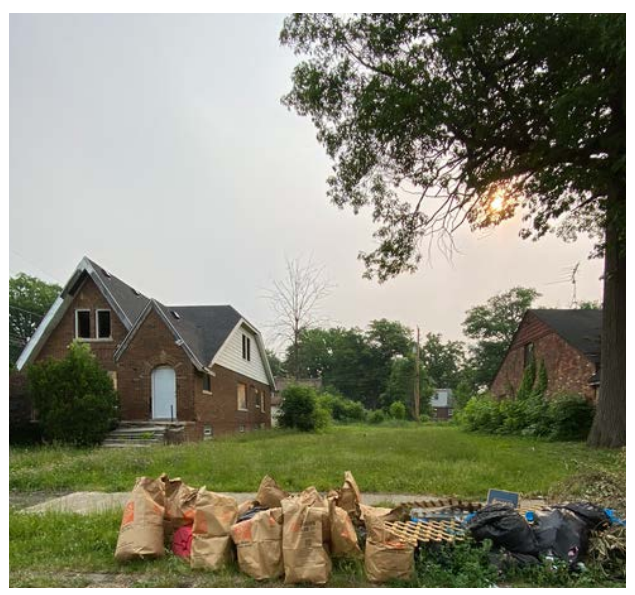
Multiple bags of trash sits alongside the berm.

Thursday, June 22 Friday, July 7 Thursday, July 20