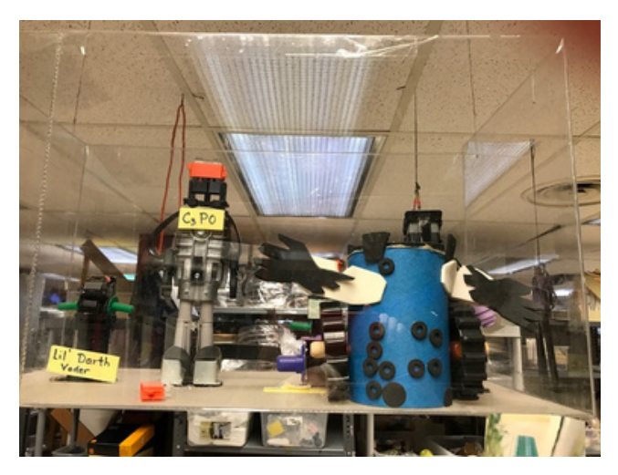
Star Wars themed Arts & Scraps figures.

Champions who raise or give $500 will receive a special invitation to our public grand finale and receive a special thank-you gift.