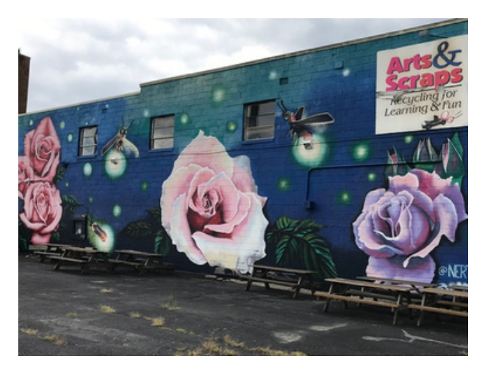
The exterior mural at Arts & Scraps.

For 34 years, Arts & Scraps has been Metro Detroit's beacon of creativity, STEM education, and environmental stewardship. That has been made possible by thousands of people doing their small part to make Arts & Scraps' impact possible.