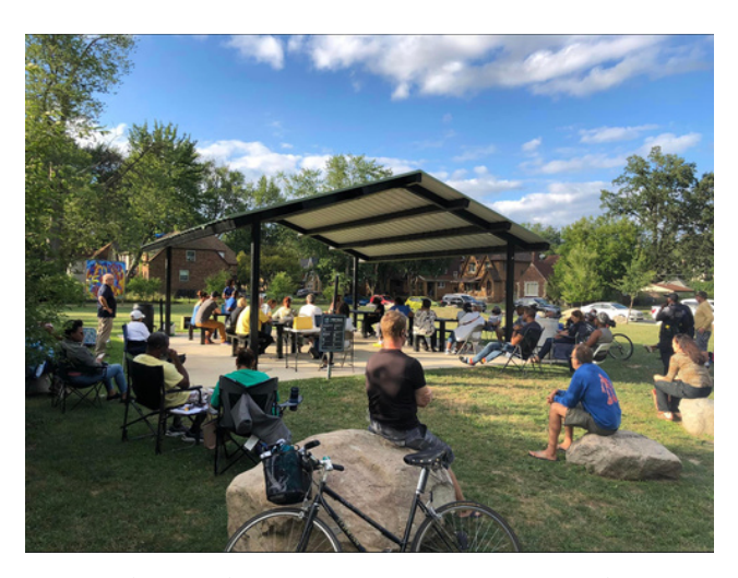
Three Mile Munich Park.

Saturday, August 5 1 – 4 PM Three Mile Munich Park