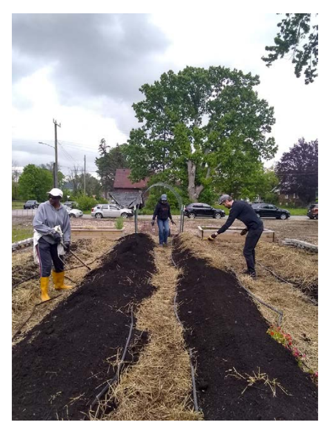
Volunteers lay fresh soil along the garden beds.

Large and highly visible projects such as these will hopefully inspire each of us to clean up and green up our own house and block. Beautification is the antidote to blight, and is equally if not more contagious. Let's keep up the momentum by improving our public spaces while at the same time reporting negative activity like illegal dumpers.