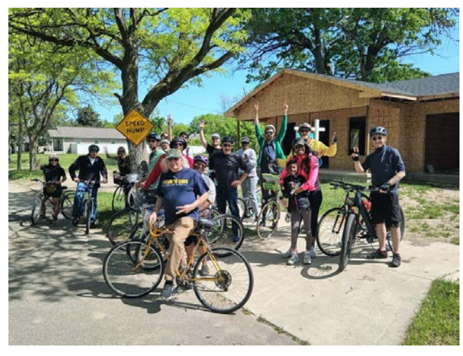
Participants at last month's bike ride.

All riders are encouraged to wear bike helmets. If you have questions or concerns, please call Nic Hall at (815) 354-2092.