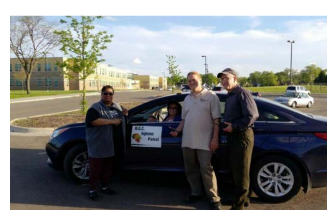
MEC Neighborhood Patrol members at East English Preparatory Academy at Finney.

Our area is covered by the 5th Precinct, 3500 Conner, Detroit, MI 48215 - (313) 596-5500. Our patrol officers are always great to work with, and our NPO Officers are awesome and very hardworking.