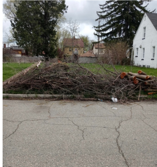
Tree limbs sits along the berm on Berkshire.

Thursday, May 11 and 25 Thursday, June 8