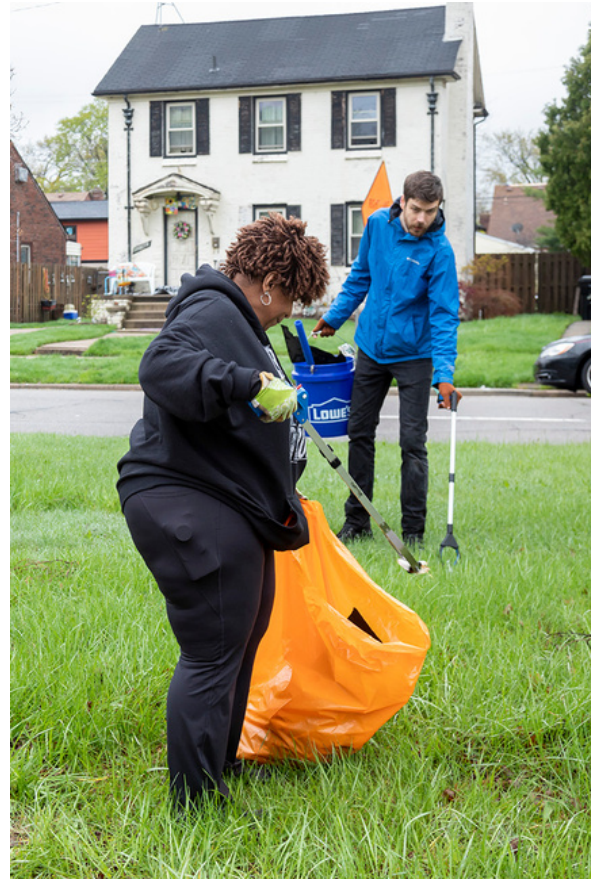
Volunteers clearing the medians of litter on E. Outer Drive.

We encourage our friends and neighbors, especially those on East Outer Drive, to join us for the summer and fall clean-ups (Saturday, August 5th, and Saturday, October 7th).