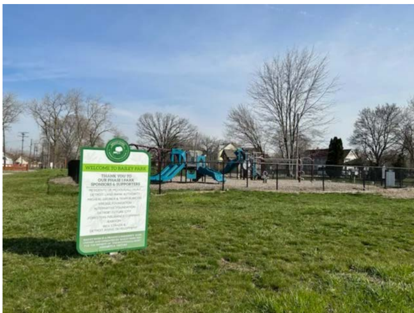
Bailey Park, located in the McDougall-Hunt community is one of the positive outcomes from the Detroit Land Bank Authority's Neighborhood Lot program.

At the April MorningSide Community Organization general meeting, there were lots of questions for the Detroit Land Bank representative about the Neighborhood Lot program. Here's an article from Bridge Detroit that tells you how the program works and what to do if you run into problems.