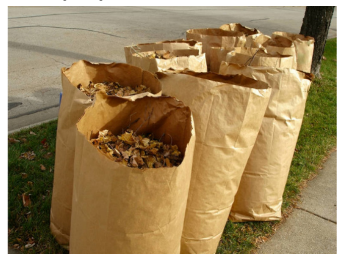
Lawn leaf bags.