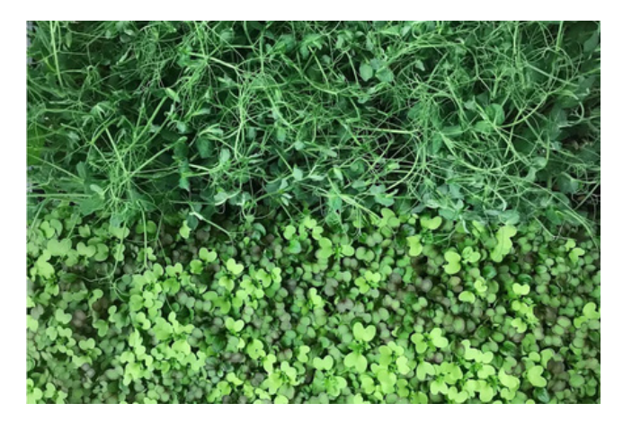
Fresh Leafy Greens.

Featherstone Garden, our neighborhood treasure on Lakewood just north of Mack, has a great newsletter with vegan recipes that are so good you wouldn't even notice that they're also healthy! They also provide prescription services for fresh flowers, a variety of mushrooms, and microgreens. Click here to access and sign up for their newsletter.