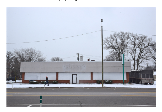
The former Charter One bank will be redeveloped into The Ribbon.

In February 2020, Invest Detroit, in partnership with the City of Detroit and their Strategic Neighborhood Fund (SNF) initiative, sought proposals to rehabilitate the "Old Charter One bank" in East English Village, located at 16530 East Warren Avenue. Invest Detroit's request for proposals (RFP) centered on identifying diverse developers for the project. The selected developer was also required to maintain transparency and an open dialogue with the residents of surrounding communities and stakeholders throughout the development timeline. After submitting our proposal, we had the opportunity to present to representatives from the MorningSide, East English Village, and Cornerstone communities, and The Ribbon was chosen as the top project.