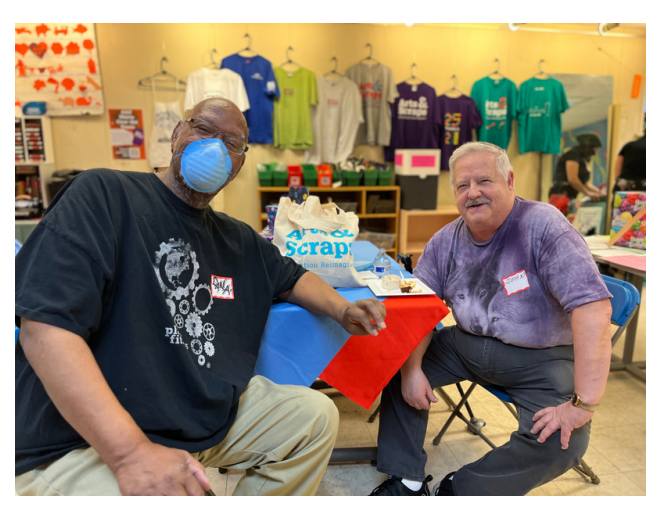
Attendees enjoy the Arts & Scraps 34th birthday celebration.

The party was a joyous occasion filled with excitement and entertainment. Attendees were gifted with goody bags filled with A&S-related activities and were given a chance to fill a small bag at the Detroit Community Store for free. A newsletter display dating back to the start of Arts & Scraps was also on display, along with a T-shirt exhibit showcasing A&S shirts throughout the years. Guests had the opportunity to buy Arts & Scraps merch from CLOZTALK.