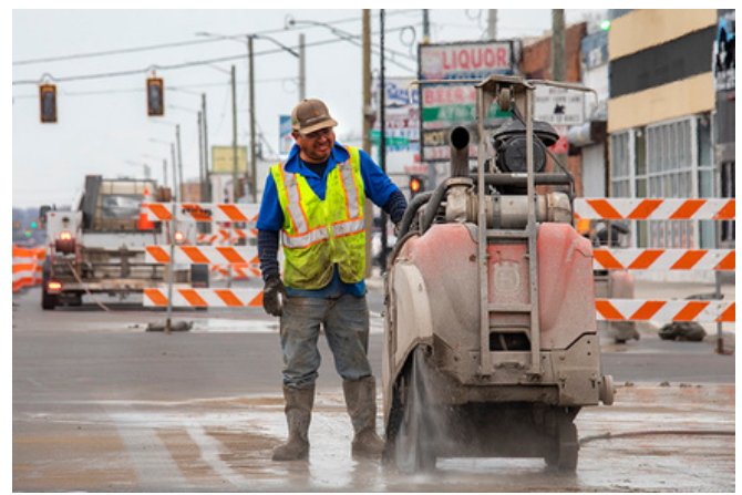
A crew member uses an industrial utility concrete saw on the south side of East Warren.