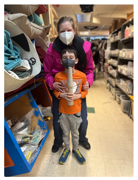
Attendees enjoy the Arts & Scraps 34th birthday celebration.

Choose monthly instead of one-time, and select the amount you'd like to donate each month!