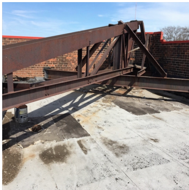
Raising the funds to cover the roof replacement at the Alger Theater will be a major priority for 2023.

Looking forward to 2023, getting a new roof will be our main priority. It will be a heavy lift, with a price tag of $200,000, so we will be rolling out a fundraising effort soon.