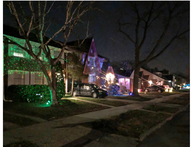
4300 Block of Bedford.

For Best Block, judges mostly considered the number of decorated houses. And the 4300 block of Bedford had A LOT of them. From Waveney to Munich, the block was a colorful oasis, a special stretch of MorningSide with bright lights and holiday cheer.