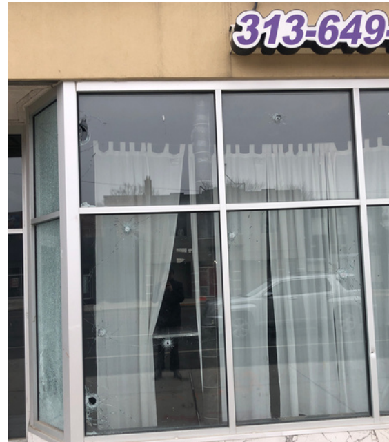
Bullet holes riddle the windows at Royalty Dance Studio.

Some may say that citizens should stay out of the business of helping government. I have personally been accused of being a "nosy neighbor." My response is that we need more, not less, nosy neighbors! Only with the full support of society can our systems work effectively.