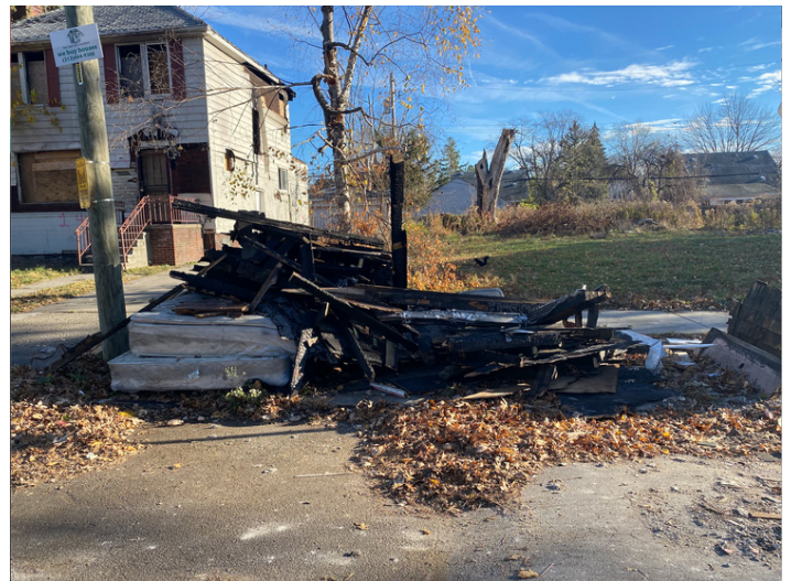
A pile of charred rubbish on Haverhill St.

Thursday, January 19 Thursday February 2 and 16