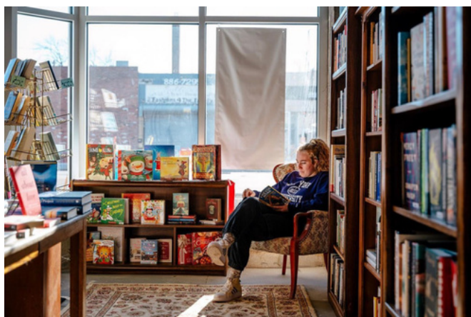
A customer reads a book inside the Next Chapter Books Pop-Up.