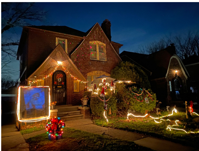
4835 Devonshire.