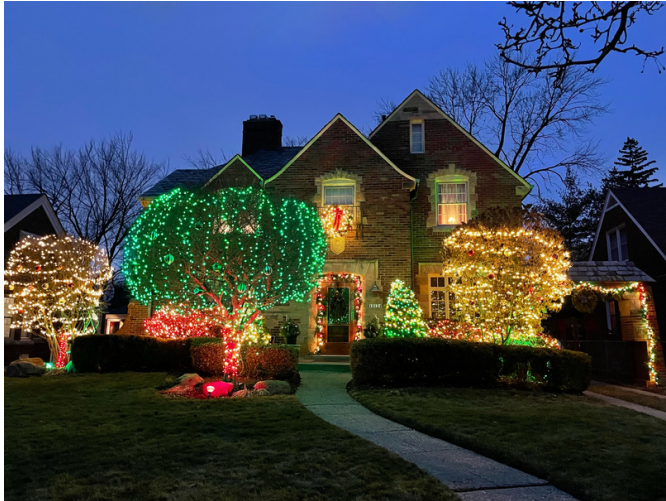
13124 E. Outer Drive.