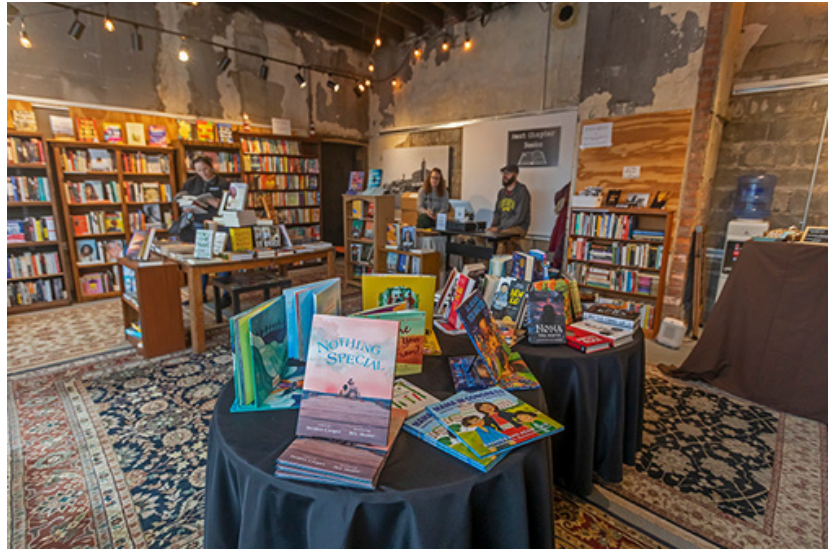
Next Chapter Books Pop-Up at the Alger Theater.

The launch of Next Chapter Books at the Alger Theater has been a successful labor of love. As first-time small business owners, we are greatly encouraged by the support we've received toward our little dream. We're thankful to the Friends of the Alger, E. Warren Development Corporation and all of you who've come to say hello, browse books, shop locally, and recommend us to friends.