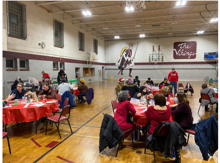
2022 Holiday Celebration Party at Bethany Lutheran Church.

Overall, the evening was amazing! It was another example of the greatness our MorningSide community continues to exemplify.