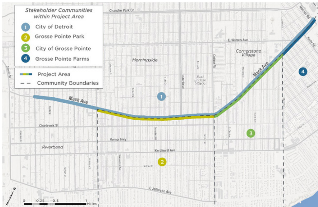
Mack Avenue Streetscape Plan – Project Study Area.