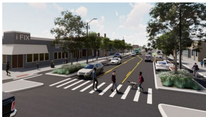
The future of the East Warren Streetscape.

So far there have been no major delays, and we're on track to have a beautiful new streetscape by sometime next spring!