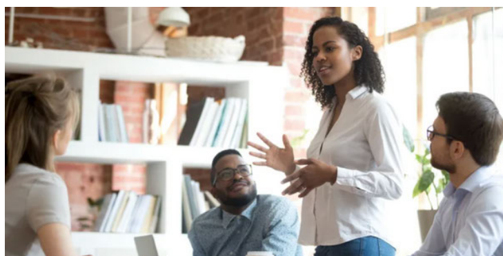
A leadership meeting.