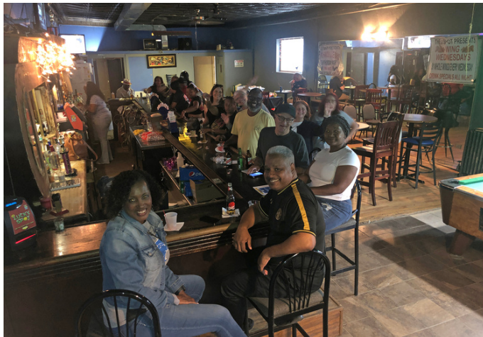
Happy Hour at Jeanie's J-Spot in June.