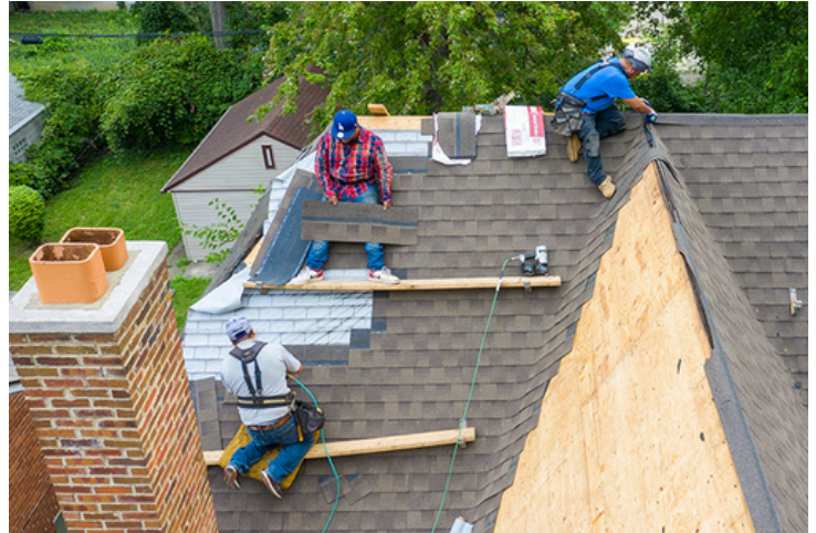
A new roof is being installed.

https://www.bridgedetroit.com/detroit-program-gets-15-million-to-repair-more-roofs-windows/?utm_source=Bridge+Detroit&utm_campaign=f5d97b7dfd-BridgeDetroit+Newsletter+08%2F04%2F2022&utm_medium=email&utm_term=0_f488832fef-f5d97b7dfd-82575312