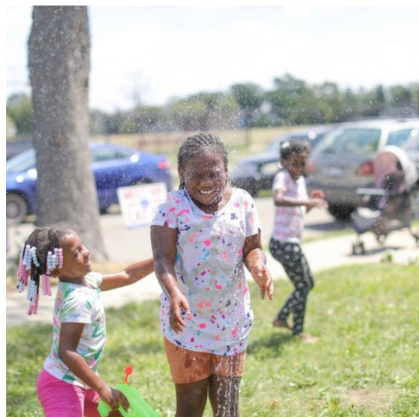
Children running through the water sprinkler.

https://docs.google.com/forms/d/e/1FAIpQLSdmS2dulGsjr5yex7nvaRfeoPxpTqLR4ZK8j3gBWIDpCTANXQ/viewform