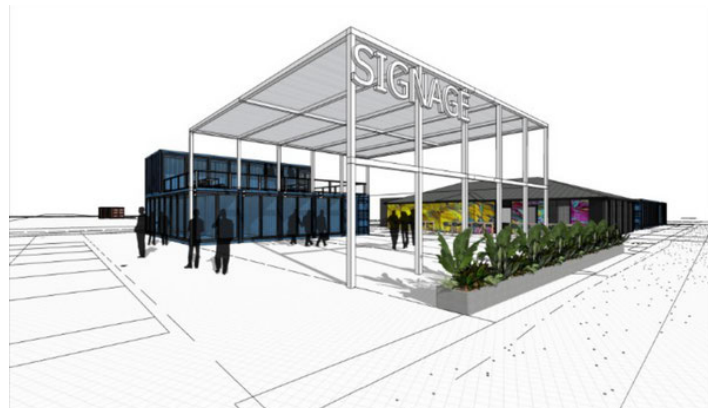
Conceptual rendering of the East Warren Farmers Market.

EWDC has had its share of challenges with the construction of the E. Warren streetscape at its doorstep, but that project should be completed by the end of this year, and EWDC is poised to do great things for our community in 2023.