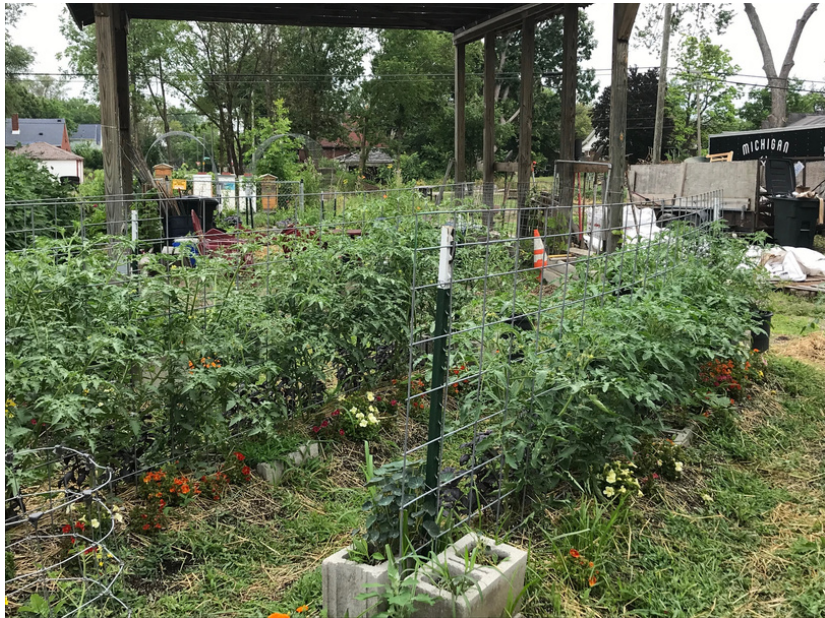
A variety of flowers and fresh produce at the Featherstone Garden.

One of the most important community partners that helps support our operations at Featherstone Garden is Motor City Grounds Crew — a nonprofit whose aim is to strengthen Detroit neighborhoods by leading green space beautification, hosting youth sports activities, and managing the East Warren Tool Library.