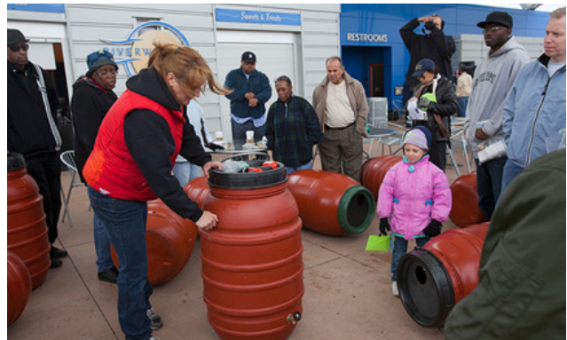
Rain Barrel workshop at the Detroit Riverfront.