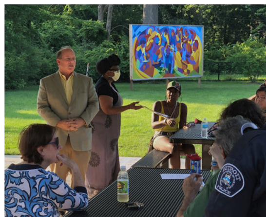
Detroit Mayor Mike Duggan listens to the concerns of MorningSide residents.

Don’t miss this opportunity to stay informed about your community and get to know your neighbors!