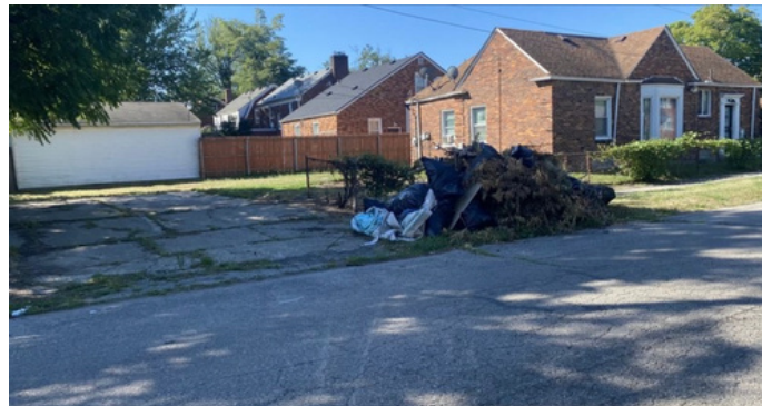
A pile of brush dumped along a side berm on Bremen Street.