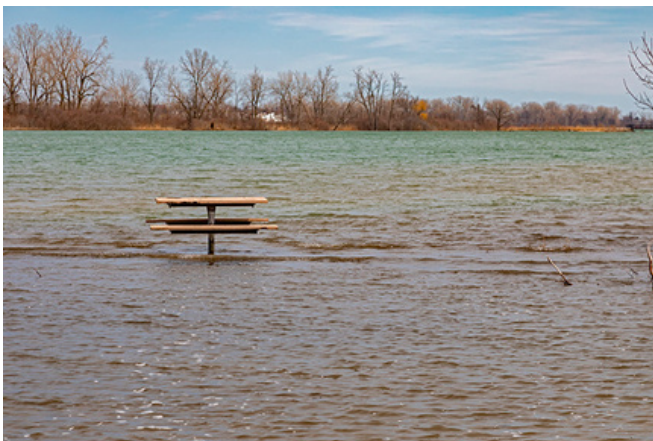
Sections of Belle Isle Park experienced significant flooding two years ago.

So what specifically are we doing about it and how can you get involved?