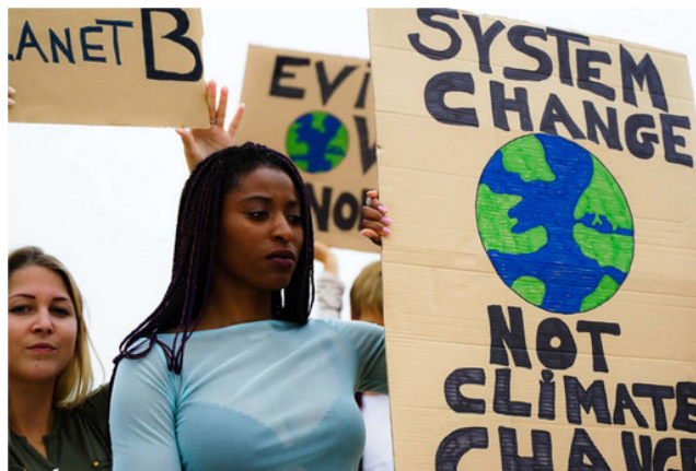
Protesters march against the systemic policies impacting Climate Change.