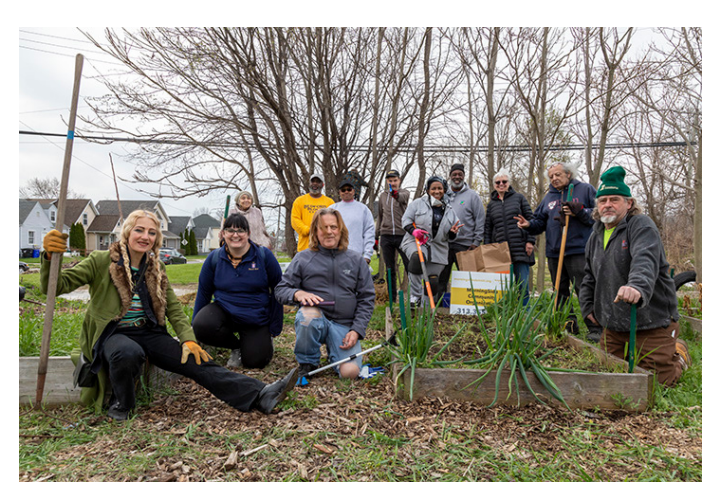
MorningSide Makeover volunteers spruced up the grounds of Grassroots Garden.

And if beautification is your thing, consider coming out to our Nottingham/Beaconsfield tree planting with Greening of Detroit on Saturday, May 14. Please sign up in advance through the Greening's website at <a href="https://www.greeningofdetroit.com/events/5-14treeplanting">https://www.greeningofdetroit.com/events/5-14treeplanting</a>.