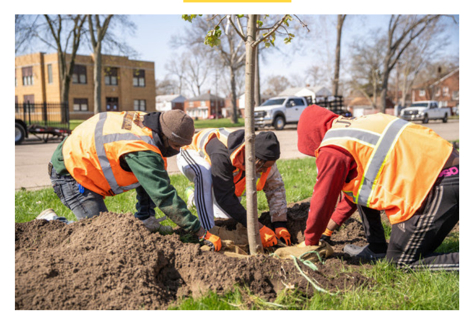
City of Detroit forestry workers plant a tree.

The City of Detroit's General Services Department is committed to planting 10,000 trees to enhance neighborhoods and promote safer and healthier communities. Currently, the Department is more than halfway to that goal and has planted 5,500 trees since the program began in 2017.