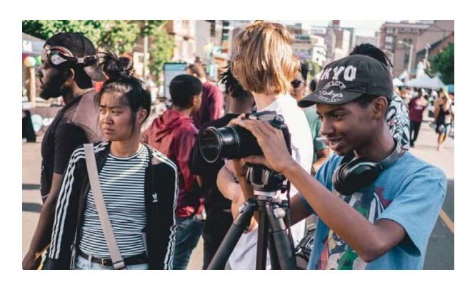
Youth journalists filming content.

The camp is free for Detroit high school students thanks to scholarships offered through the nonprofit Coaching Detroit Forward. There is a registration fee for students nationwide.