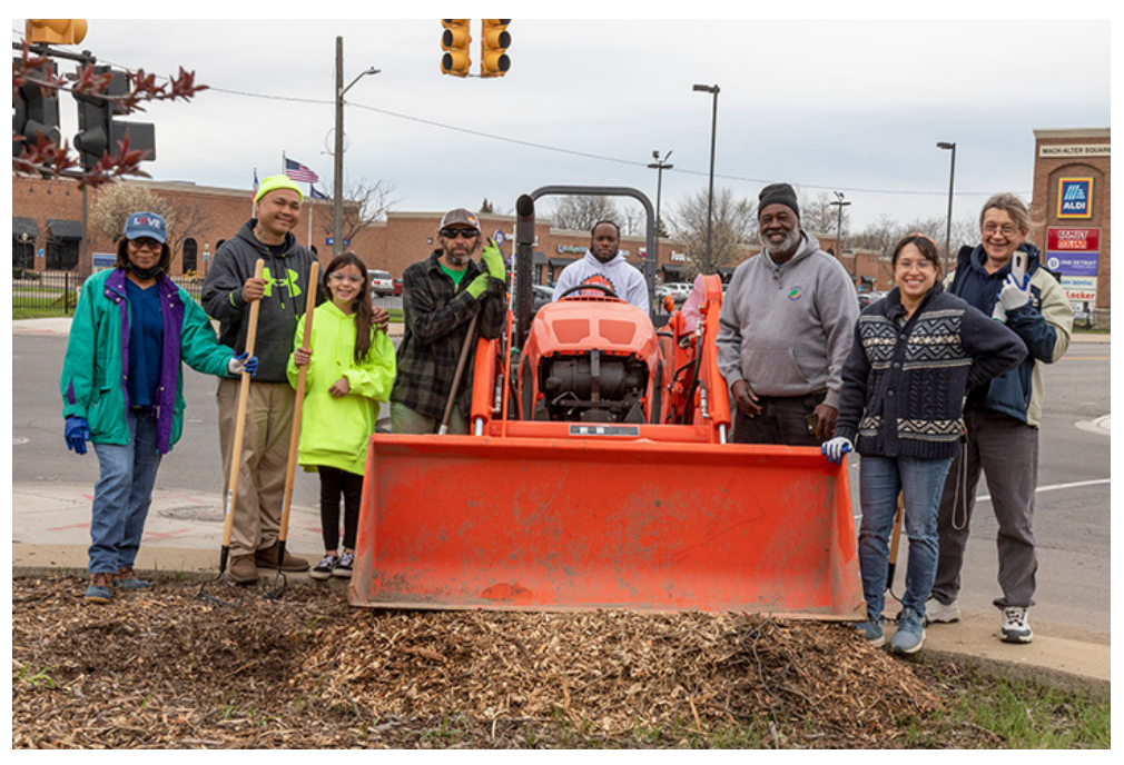
Volunteers at the Morningside Gateway Park.

Morningside's Finest is dedicated to all the volunteers who dedicated their energy and time on April 30 in beautifying our community greenspaces in Gateway Park and Grassroots Gardens. Volunteers came ready to get their hands dirty as they removed litter, cleared garden beds, added fresh mulch, and so much more. There are too many individuals to name, but their contributions... do not go unnoticed.