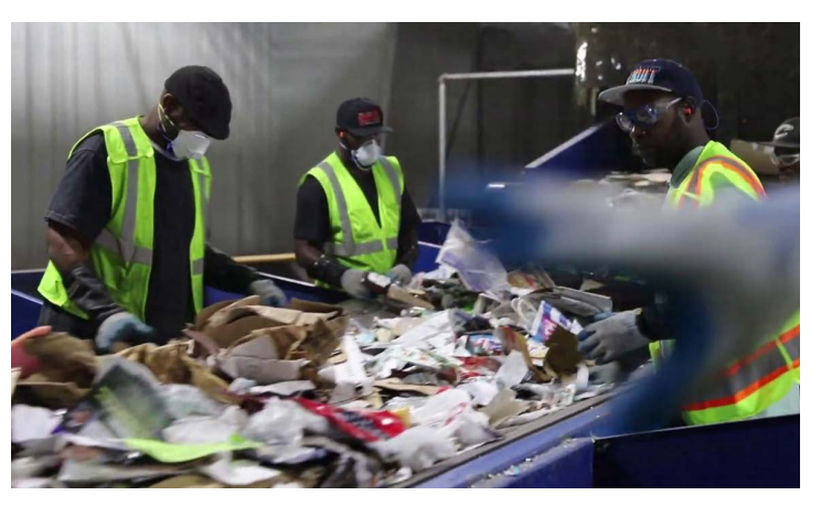
Workers sorting through recycled material.

Thursday, May 12 and 26 Thursday, June 9