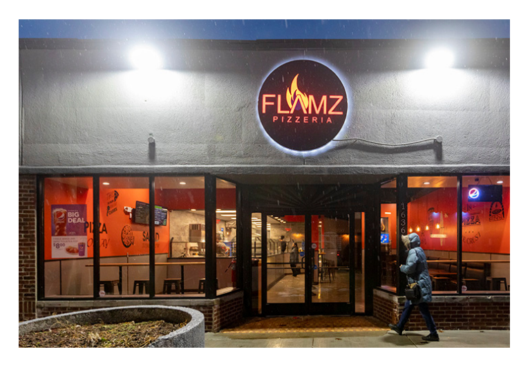
Flamz Pizzeria.

After a months-long hiatus, they were able to re-open and were getting customers back, but on January 4 of this year, a fire two doors down at Shoetique caused significant smoke damage and forced them to close their doors yet again.