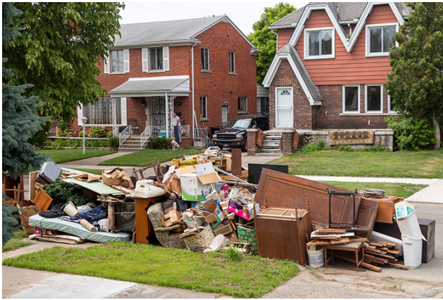
Ruined household items as a result of the Summer 2021 floods.