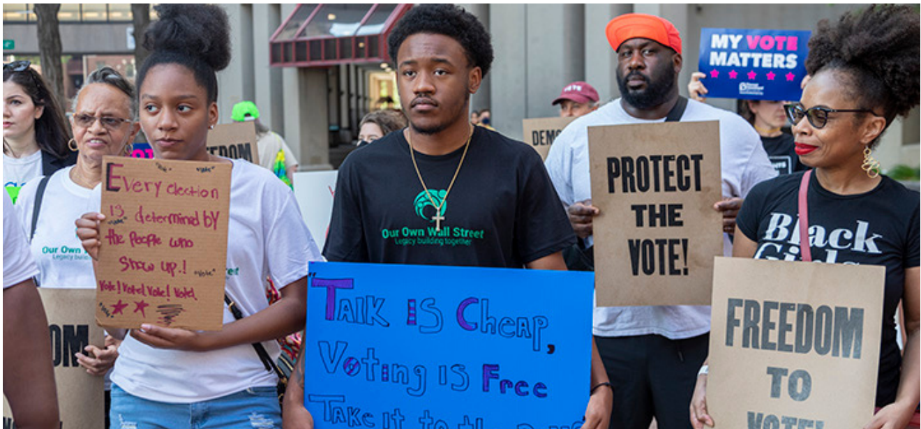
Demonstrators voicing the importance of protecting voters right.