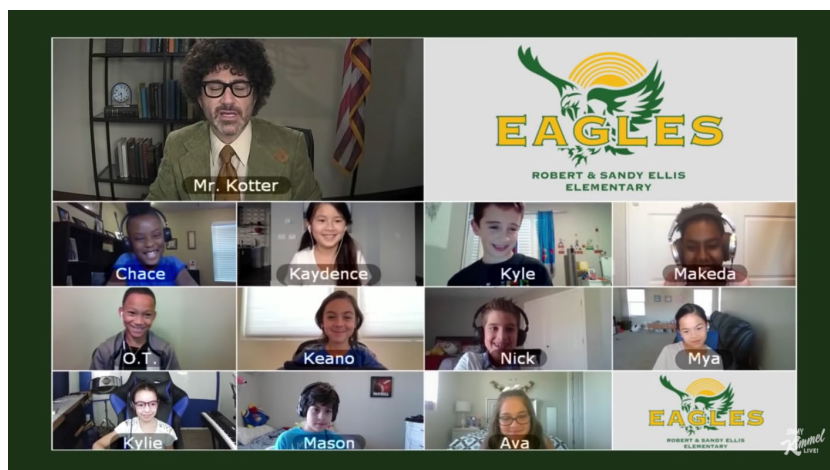
Late night talk show host Jimmy Kimmel with a fourth grade class at Ellis Elementary in Las Vegas, Nevada

https://www.youtube.com/watch?v=IZOFpEjfxU