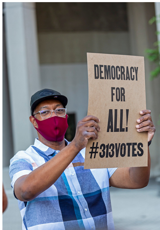
A demonstrator holds up a sign for voter rights.

This is common-sense legislation that goes far toward ensuring that all of the voices of Michigan are respected and heard. I urge you to sign this petition wherever you see it circulated. Better yet, support the effort by making a donation or signing up to circulate the petition yourself. See https://promotethevote2022.com/ to get involved.