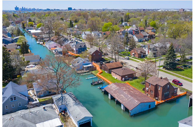
Many households near the Fox Creek canal experienced significant flooding last summer.

The Basement Backup Protection Program will start this spring in the two neighborhoods hardest hit by the flooding - Aviation Sub and Victoria Park. MorningSide will be part of the second phase, beginning this summer.