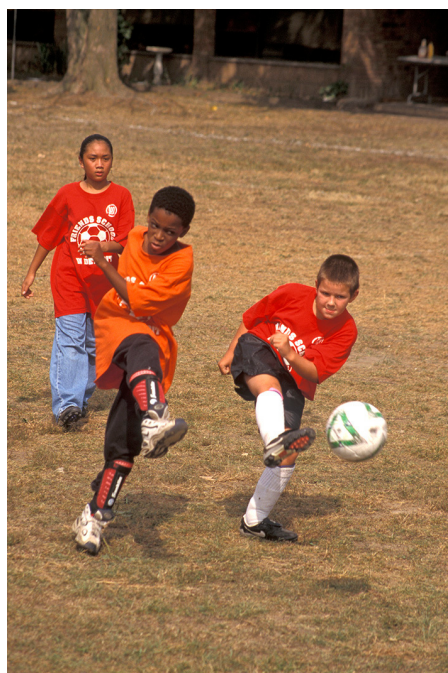
Children playing soccer.

The Parks & Rec Department will also be offering other youth sports this spring and summer, including flag football, basketball, and T-ball.