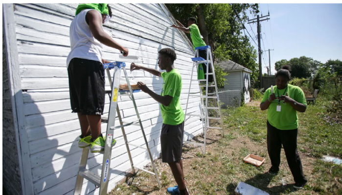
Detroit youth of the GDYT program paints a garage.

8,048 Detroit youth were employed through GDYT during the 2021 program, the seventh straight year of exceeding the program's target of 8,000. To maintain social distancing protocols, GDYT made more than 6,000 of the 2021 summer opportunities virtual and the program will provide similar accommodations in 2022.