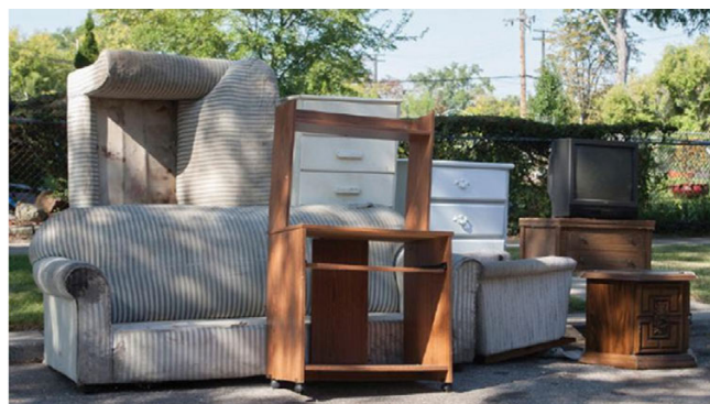
Bulk trash sits curbside.