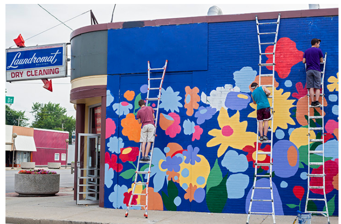
A colorful mural alongside Jeff's AAA Dry Cleaning.

Call-in number: 301-715-8592 Meeting ID: 876 5627 5944 Password: 824390