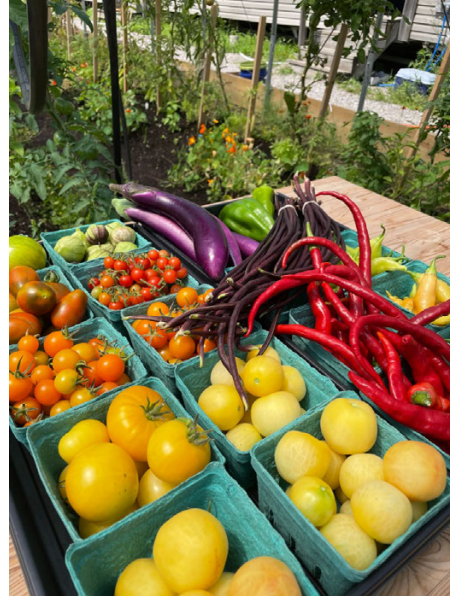
A colorful variety of fresh, organic produce.