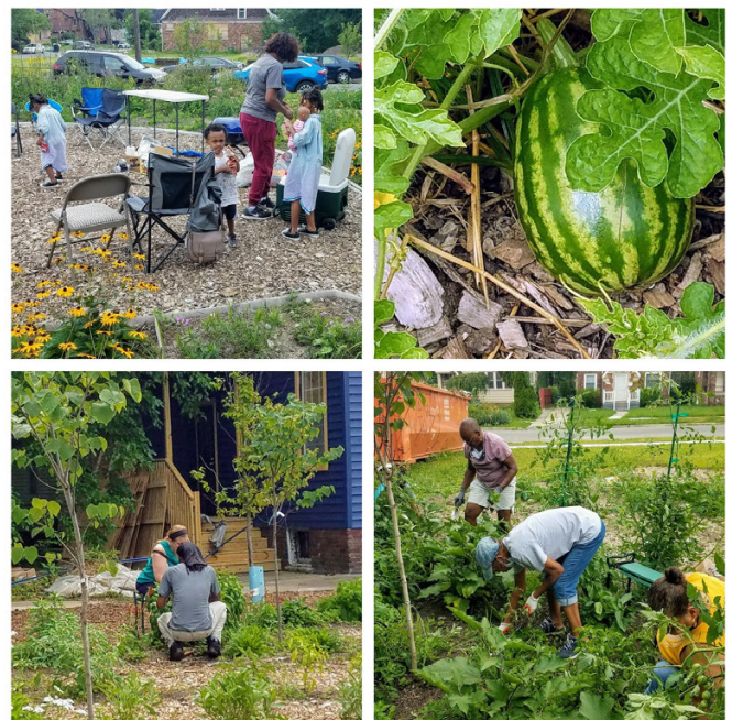
Work continued throughout the summer to enhance Emerald Gardens.