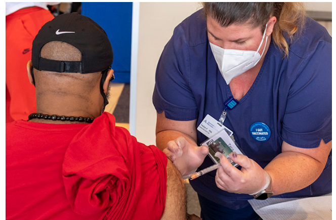
Vaccination is being administer.