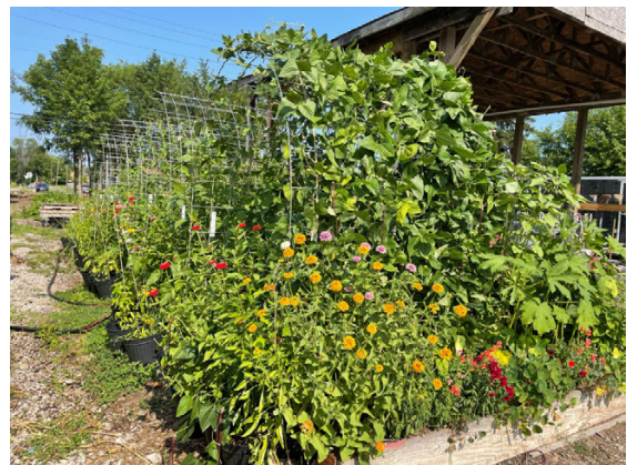
Featherstone Garden.