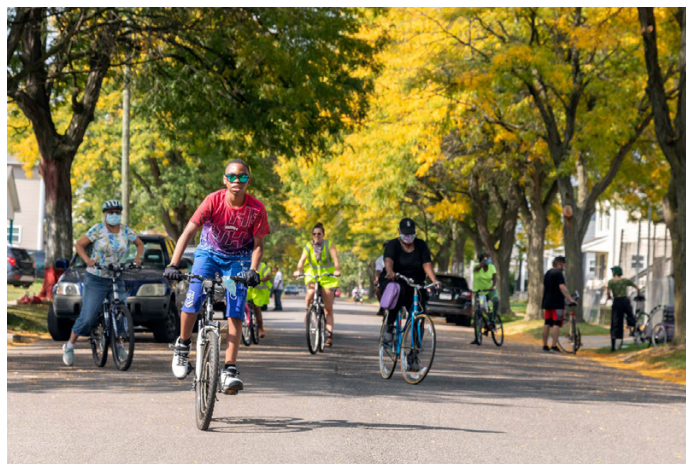
Community members enjoying bike ride last year.