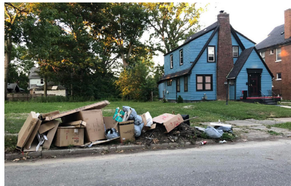
Trash sitting on the berm.