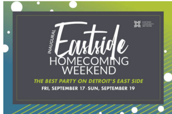
The Eastside Homecoming Weekend will be taking place this weekend.

Don't forget that you can report dumpsters and trash set out too soon or left out too long through www.SeeClickFix.com or the Improve Detroit app on your phone.