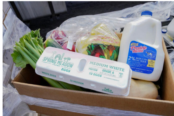
A variety of food perishables.