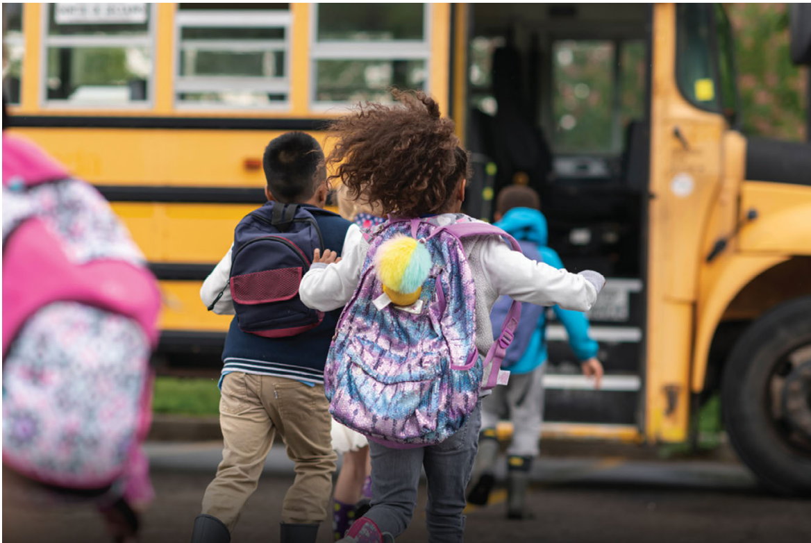
Children loading the school bus.

As our students safely return to the classroom, just know we're excited for you to enjoy the fun adventures of learning and once again becoming familiar with the great atmosphere of a school environment.