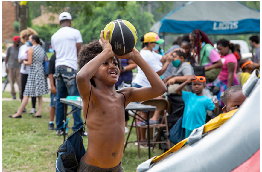
A young man takes a jumpshot.

Last month, we were given the great opportunity to celebrate the grand opening of the new Brilliant Detroit Morningside Community Home! More than 130 residents had a chance to tour the renovated house, which will be a hub for community activities such as tutoring, health education, exercise programs, and parenting support.