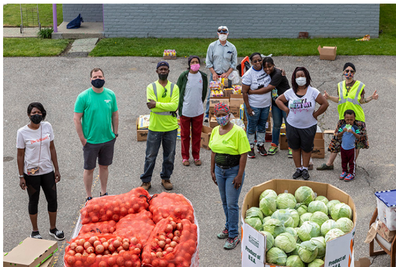
The Gleaners / MorningSide Food Distribution Volunteers.

To all the volunteers who have lent a helping hand during the blazing heat of the summer sun, to the blistering winds of the winter, your dedication to assuring no one in our community goes hungry deserves to be recognized as being MorningSide's Finest!