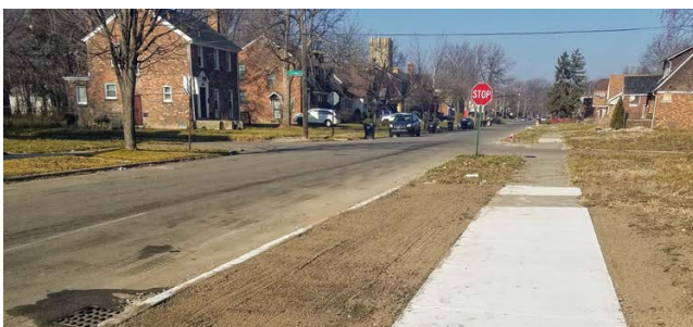
After: The installation of a new sidewalk and a clean berm no longer presents a dangerous path for pedestrians.

This summer, we will collaborate with the Community Economic Development Association of Michigan (CEDAM) and Bethany Lutheran Church to address food insecurity in our community. We have hired a Summer AmeriCorps Member to assist Bethany Lutheran Church with its bi-monthly food pantry and to help us establish the market garden. The produce from the market garden is intended to be sold at farmers' markets. However, due to the COVID-19 pandemic, we are dedicating the garden to the community. We will share the produce with volunteers and people in the community who need fresh, nutritious food. We will also host a Lunch & Learn to Garden on Wednesdays during June and July.