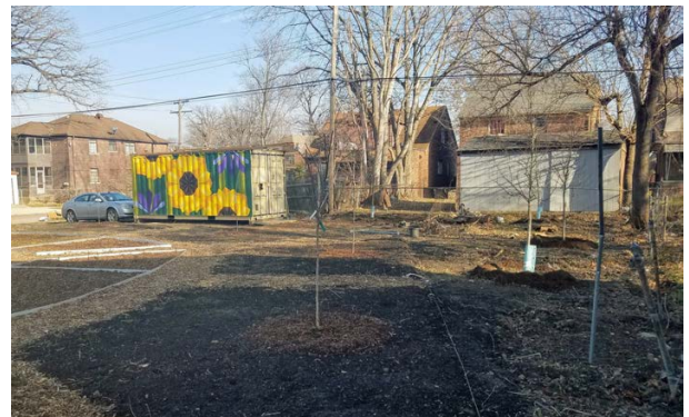
Freshly planted trees in Emerald Gardens.

This summer, we will collaborate with the Community Economic Development Association of Michigan (CEDAM) and Bethany Lutheran Church to address food insecurity in our community. We have hired a Summer AmeriCorps Member to assist Bethany Lutheran Church with its bi-monthly food pantry and to help us establish the market garden. The produce from the market garden is intended to be sold at farmers' markets. However, due to the COVID-19 pandemic, we are dedicating the garden to the community. We will share the produce with volunteers and people in the community who need fresh, nutritious food. We will also host a Lunch & Learn to Garden on Wednesdays during June and July.