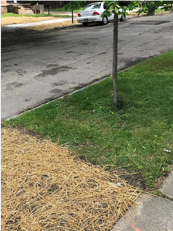
Grass seeds and straw has been placed to repair lawns throughout the MorningSide.

The DTE project will continue throughout the summer until all of MorningSide's gas lines have been replaced.