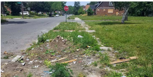
Before: The condition of the sidewalk and berm was a hazard for pedestrians.

The outpouring of support from the community has been tremendous. Family, friends, and nearby neighbors have helped us clean the lots and plant over 500 native plants that attract butterflies, birds, bees, and people. Cheryl English, Advanced Master Gardener and owner of Black Cat Pottery, helped me select the native plants. Detroit Future City provided most of the funding and technical assistance. Impact Detroit funded four redbud trees. The Greening of Detroit provided volunteers and donated four large Hawthorn trees that they planted as well. Last but not least, the City of Detroit planted four white flowering crabapple trees in the berms on Cornwall and will soon plant four shade trees in the berms on Haverhill. The city also replaced several damaged sidewalk slabs, making it a safer and much more attractive environment.