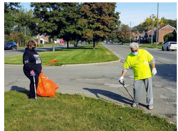
Emerald Isles CDC volunteers picking up trash along the medians of East Outer Drive.