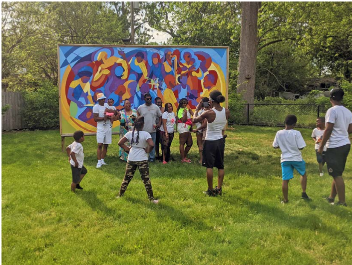
Neighbors posing for a photo next to the newly painted mural, The People of MorningSide.

JD: I spent about 5 days on the mural. During the week it was pretty quiet, but I did speak briefly with a couple of folks who were using the park. On Friday evening as I was wrapping up, there was a birthday party forming and I had a great conversation with a person whose father is a stained-glass artist. Some folks from the party took a group photo in front of the painting so it felt like a success at that moment.