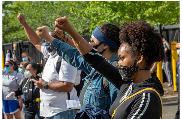
Protesters standing united during the Black Lives Matter movement during Summer 2020.