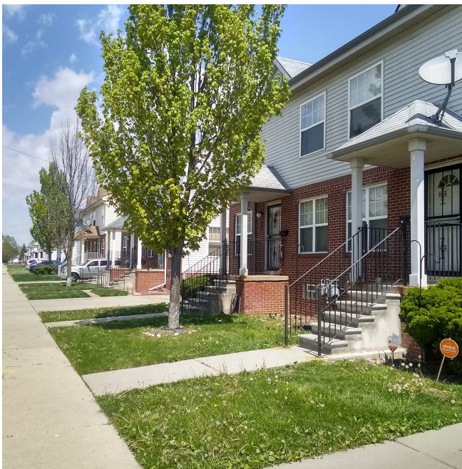
One of the 64 townhomes built along Alter and Wayburn on the western end of MorningSide.

Started by a collective of eastside block clubs and neighborhood associations in 1985 to attract home repair grants, U-SNAP-BAC has grown into a developer of affordable housing whose success is recognized in state and national circles. Its first major development, Morningside Commons, consisting of 40 single-family homes on Wayburn Street, welcomed new residents to MorningSide in May of 1998. Even more affordable were the 64 townhouse units built along Alter and Wayburn in 2003. Later developments included 27 single-family homes on Wayburn south of E. Warren, a tot lot near Mack Avenue and a passive park at the corner of Waveney and Alter.