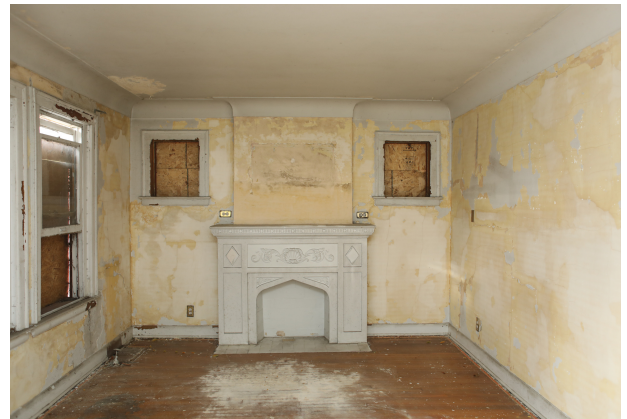
The interior of the Brilliant Detroit house in MorningSide will receive a complete renovation.