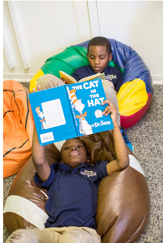
Children enjoying a Dr. Seuss classic, The Cat in the Hat.