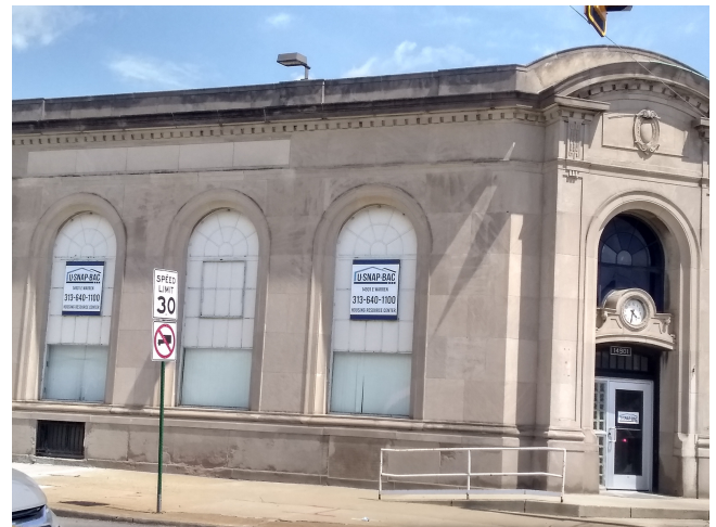
The home of U-SNAP BAC.