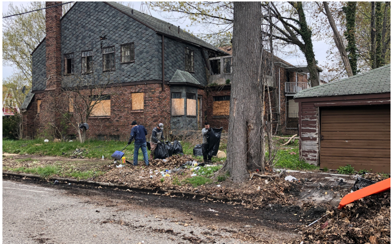
A private crew cleaning up 4800 Bedford.

4800 Bedford is a long-vacant property that has attracted a considerable amount of dumping over the years. At the corner of Bedford and Cornwall, it's a conspicuous spot that neighbors have wanted to see cleaned up.