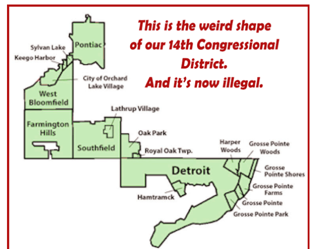
The current map of the 14th District.

For example, for at least ten years MorningSide has been split into two state House districts, which means that with each State Representative, we have only half the power we could have. When it comes to the U.S. Congress, our 14th District has twisted all the way up to Pontiac. That made it hard for people in any one place to get our Rep’s attention. And that was just fine with politicians who drew those district lines statewide to keep themselves in power.