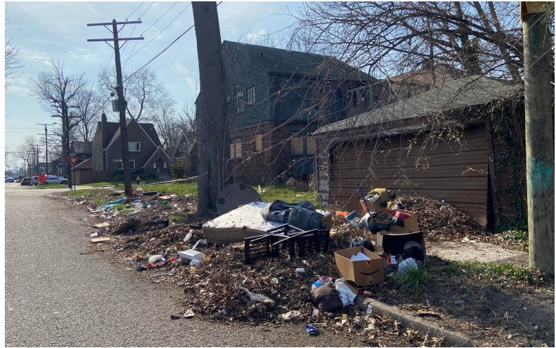
The cleanup location at the corner of Bedford and Cornwall.

Clean Neighborhood Club | Morningside Community Organization