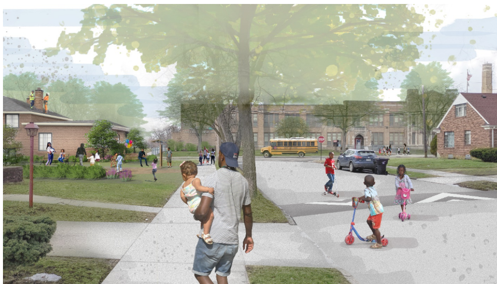
Rendering of repurposing the residential block of Chatsworth street.