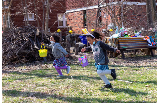
Children enjoying the Easter Egg Hunt.