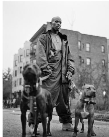
DMX.