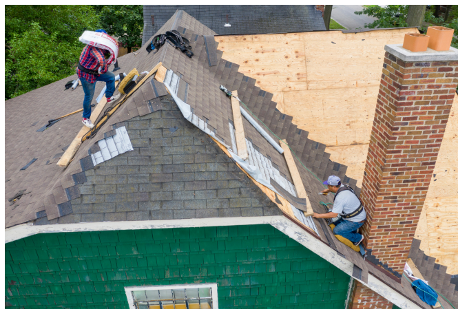
The installation of a new roof is one of the many repairs the program offers.

Send your comments to morningsidecommunity2@gmail.com . Letters edited as necessary for space and clarity, will be published each month.