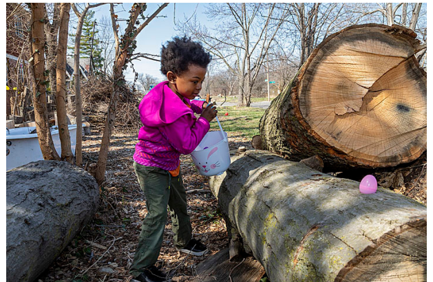
A spotted Easter Egg.