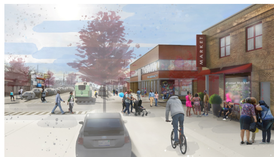
An artist's rendering of what East Warren could resemble following the investment through the Strategic Neighborhood Fund.