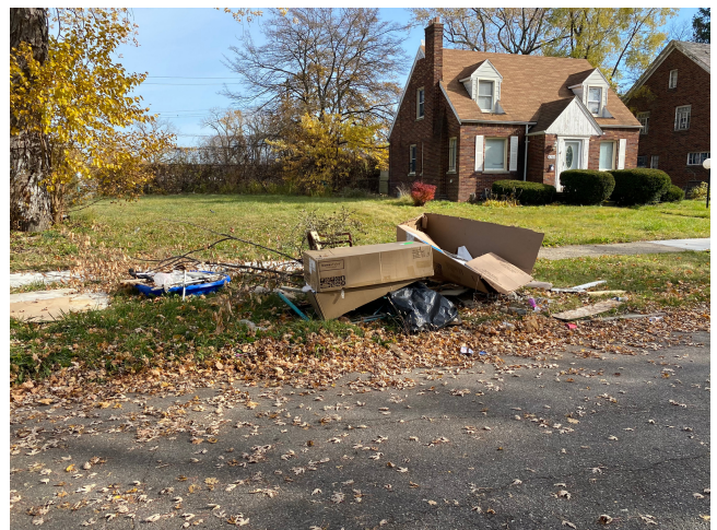
Illegal Dumping is one of the many items you can report via the Improve Detroit app.

Please share this information with your neighbors!