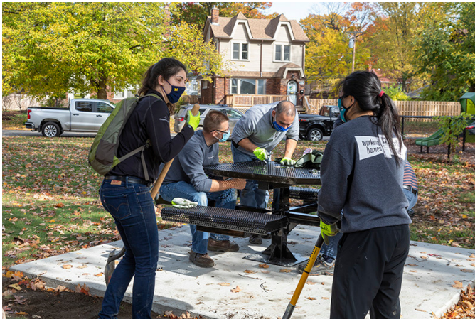
Volunteers from Cooper Standard help install picnic tables at the Three Mile Munich Park.

The Alpha Panels for the murals were key items installed during the upgrades. The community will soon announce the selected artist whose artwork will grace our neighborhood park.