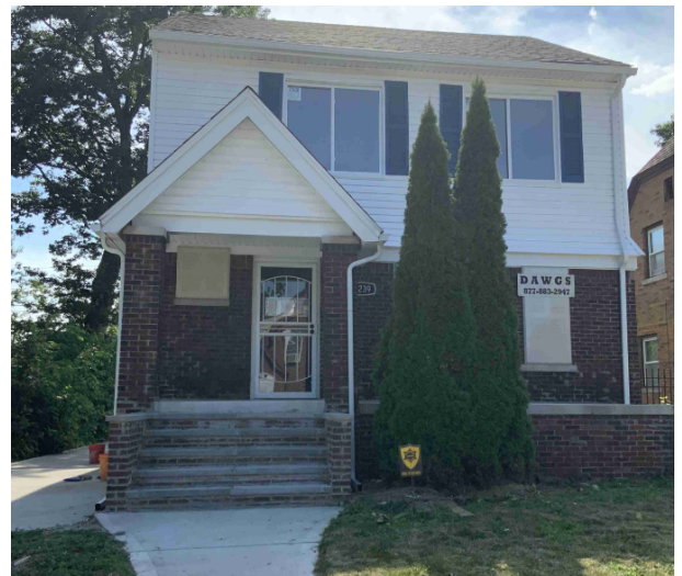
After: 5239 Three Mile Drive, renovation completed.