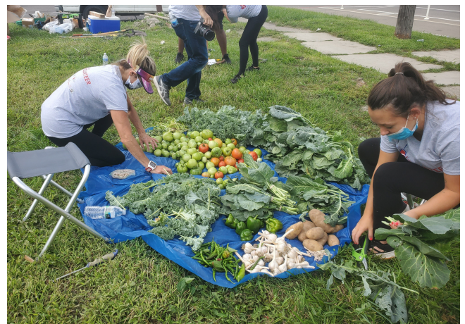
Volunteers of Ilitch Charities sorting out fresh produce.

To me, one of the essentials to grassroots organizing is to always make sure home is taken care of and prioritizing your agenda. It means, gathering and collaborating with other community-centered residents, businesses, schools, churches, etc., to accomplish things for the common good. As mentioned, when presented with the opportunity, the committed quickly responded! Subsequently, the pride and honor of the 2020 Grassroots Garden transformation is shared with a host of friends and neighbors who agree, we want and expect the best for our community!