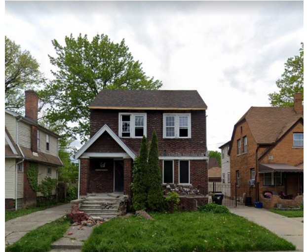
Before: 5239 Three Mile Drive.

As for financing, purchasers aren't required to use any particular loan product. The RRR program accepts conventional, FHA and VA loans, as well as cash offers. In Detroit these institutions have a track record of financing projects similar to RRR: Detroit Home Mortgage, Quicken Loans, and Liberty Bank.