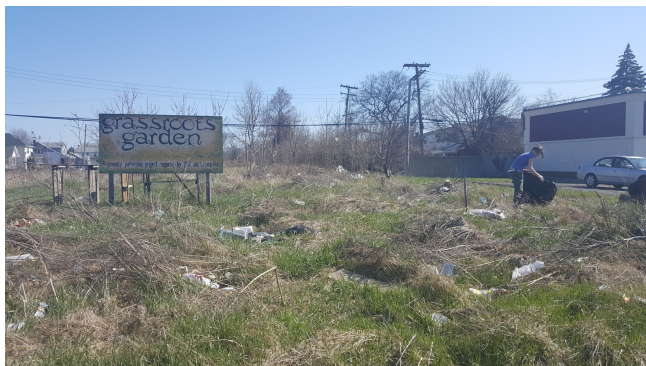
Grassroots Garden prior to the Motor City Makeover.

As we continue to grow and enhanced this space, I invite you to participate and support the work at the Garden! It's the concept of Give a Little Time, Take/Share A Little Food, and/or Take a Book, Share a Book at the Little Free Library. Assistance of any kind is welcome. For more information, you can reach us at growingmorningside@gmail.com .