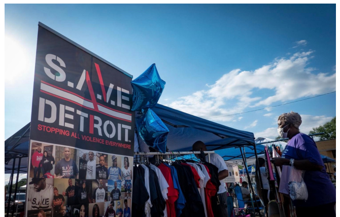
Patrons checking out the Save Detroit (Stop All Violence Everywhere) apparel.

Although these funds were intended to help redesign a brick and mortar space and provide an informational space for the E Warren-Cadieux Planning Study, due to COVID-19 we were forced to pivot and identify alternative mechanisms to implement this grant. The team went back to the drawing board and analyzed responses received by the E. Warren/Cadieux Planning study survey, which indicated many residents were interested in a local Farmers Market