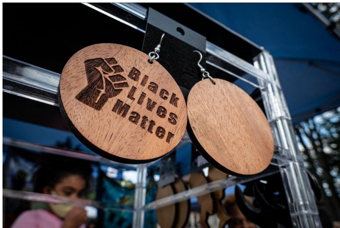
Customized earrings dedicated to the Black Lives Matter movement.

The market is a program of the E. Warren Development Corp, whose mission is to support and enhance the E. Warren commercial corridor and adjacent neighborhoods through collaboration, community engagement, and equitable development. Our vision is to have 100% business occupancy of E Warren with a diverse mix of walkable, accessible community driven businesses that serve everyone in the community.