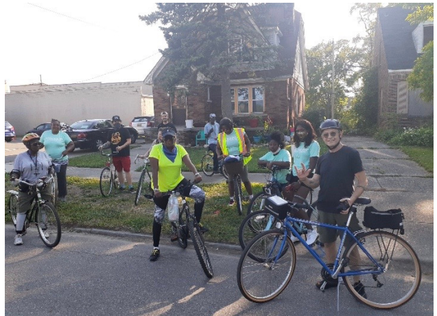
Bike riders participate in the Morningside Storytelling Bike Ride.