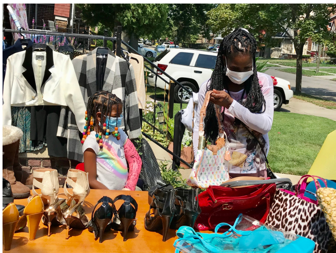
Morningside neighbors partaking in the MCO Community Garage Sale.

We sponsored our first-ever community yard sale on August 29th, giving residents a reason to get out and meet their neighbors throughout the community. By all accounts, the event was successful enough that it may turn into an annual event.