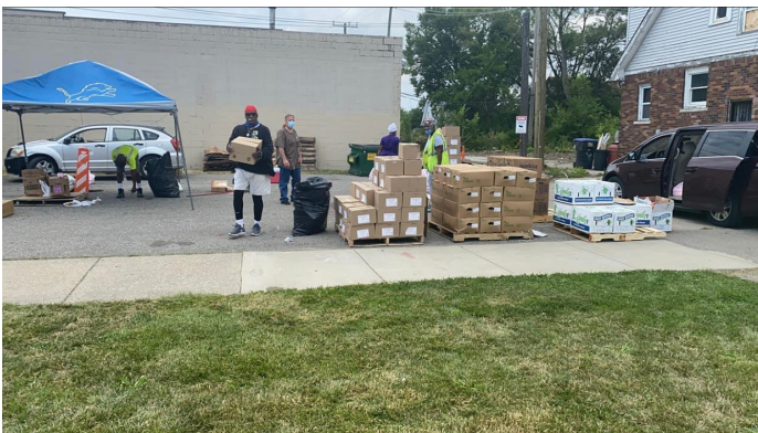
Volunteers assisting in the MCO + Gleaners food distribution.

The Morningside/Gleaners food distributions are held at the Craft Cafe, 15641 E. Warren Ave, at 11:00 a.m. on the second and fourth Monday of every month.