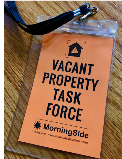
VPTF Identification lanyards will be available for all volunteers.

There will be a training session for all those interested in joining the VPTF on Saturday, September 12th at the Featherstone Garden, 4178 Lakepointe at 10 a.m.