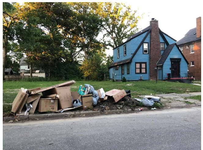
Illegal Dumping is one of the many items you can report via the Improve Detroit app.

Better yet, sign up for text reminders by texting your address to: (313) 800-7905.