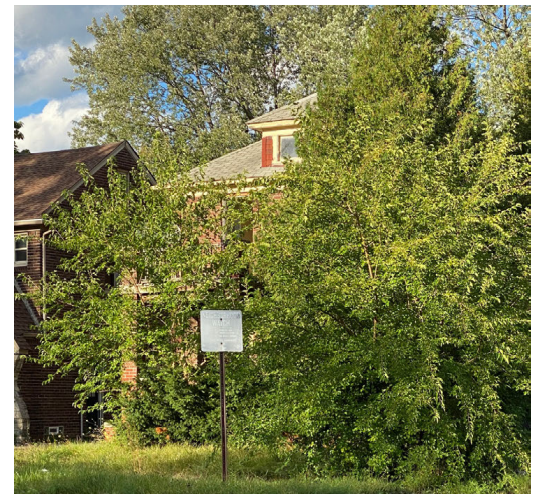
The Vacant Property Task Force will address abandoned and brush-filled properties such as this one on Balfour Rd.