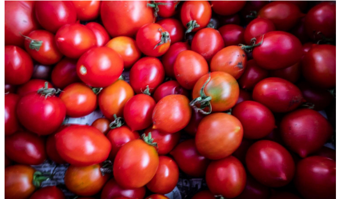
Fresh batch of tomatoes at the East Warren Farmers Market.

As a result, the team was able to re-envision the use of these funds to meet the interests of the community during these unprecedented times.