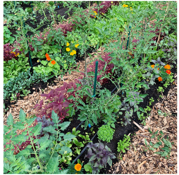
A mixture of colorful plants and vegetables in the Featherstone Garden.

For more information about Featherstone Garden and their CSA program, check out their website at www.featherstonegarden.com . You can also follow them on Instagram, @featherstone.garden. Beginning this month, Featherstone Garden will also have a weekly farm stand. (See sidebar).