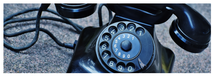
Don't hesistate, we're a phone call away Morningside

The Morningside Community Organization is striving everyday to be of service to the needs of our neighbors. Over the last few months we heard the public voice their concerns of being unable to contact our organization when there are needs or questions that have arisen. Well we are extremely happy to announce that we have a new number to address all your concerns. For all inquiries, feel free to contact us at (313) 355-2468. Our hours of operation are Monday - Friday, 9AM - 5PM.