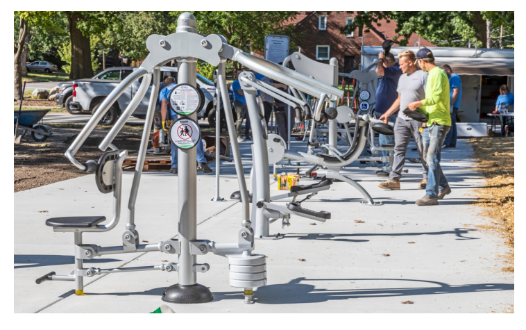
The installation of weightless exercise equipment was recently added at the Three Mile - Munich Park.

Fitness Parks are becoming extremely popular in the city of Detroit. The weightless equipment has recently been added to our neighborhood park, Three Mile - Munich Park. It provides residents with a option that is safer than the equipment you will find at your local gym and better yet, it's absolutely free to use. Enjoy Morningside!