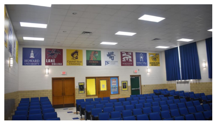
HBCU Inspired Middle School Auditorum at Ronald Brown Academy

Perhaps best of all, MorningSide will now be able to provide easy access for residents with mobility issues, as the school is ADA-compliant.We hope you'll join us as MorningSide grows larger and stronger!