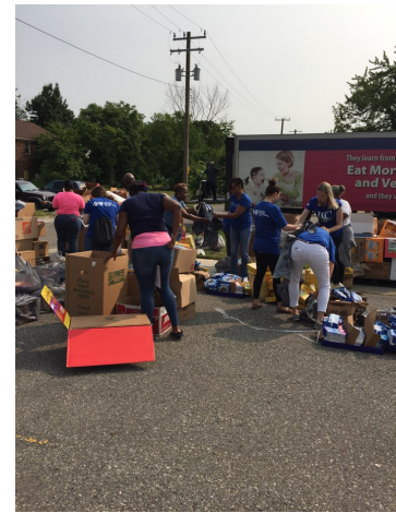
Volunteers of Morningside and employees from Blue Cross Blue Shield prep for July's food distribution.

The 2nd Monday of every month, Gleaners Food Bank will be present in Morningside distributing food to those in need. We encourage those within Morningside, as well as our surrounding communities to come out. Please share with those who may be of need. The distribution will begin at 10AM and will be located at The Craft Cafe, 15641 E. Warren Ave.