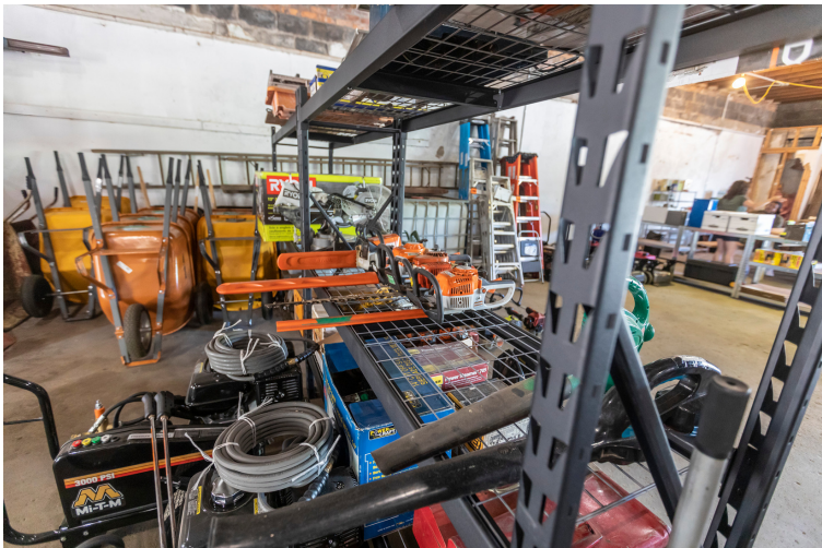
The East Warren Tool Library is fully stocked with a variety of tools needed to complete your DIY project.