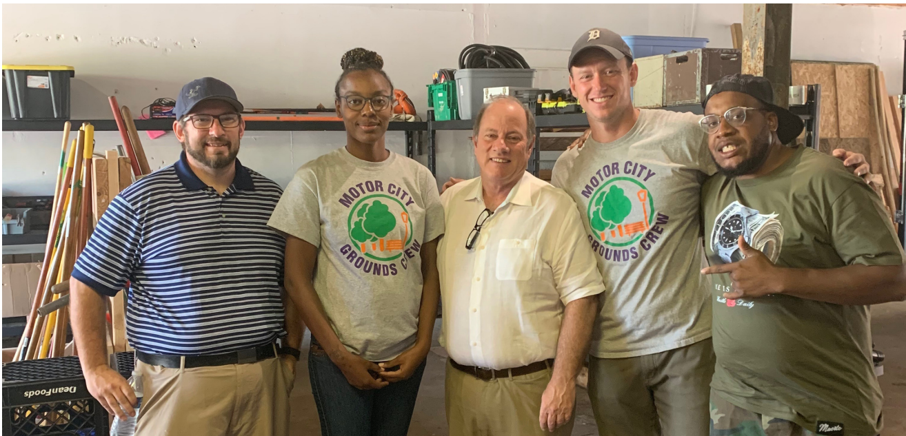
Mayor Mike Duggan joins the staff of The East Warren Tool Library.