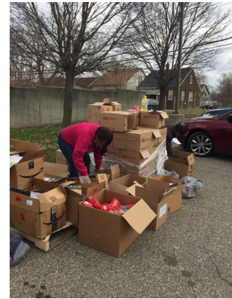
Prepping for Gleaners food distribution.

If you know of anyone in need of food assistance, please come out to the Gleaners Food Bank distribution on June 10th. The food distribution will begin at 11 a.m. Location to be announced.