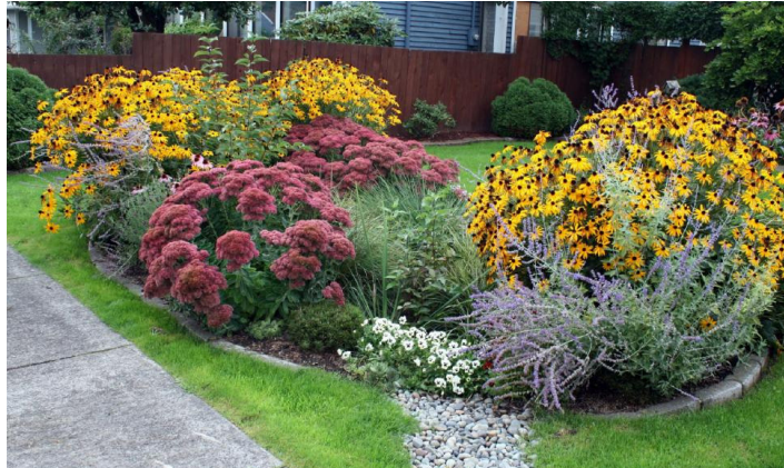
Perennial Rain Garden