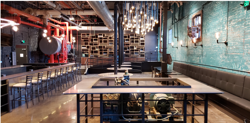
Detroit Vineyards Tasting Room.

Many of the elements that remained in the former Stroth's factory were preserved by Detroit Vineyards as it was their way of honoring Detroit's historic past. Detroit Vineyards is open seven days a week and features a excellent selection of wine to choose from.