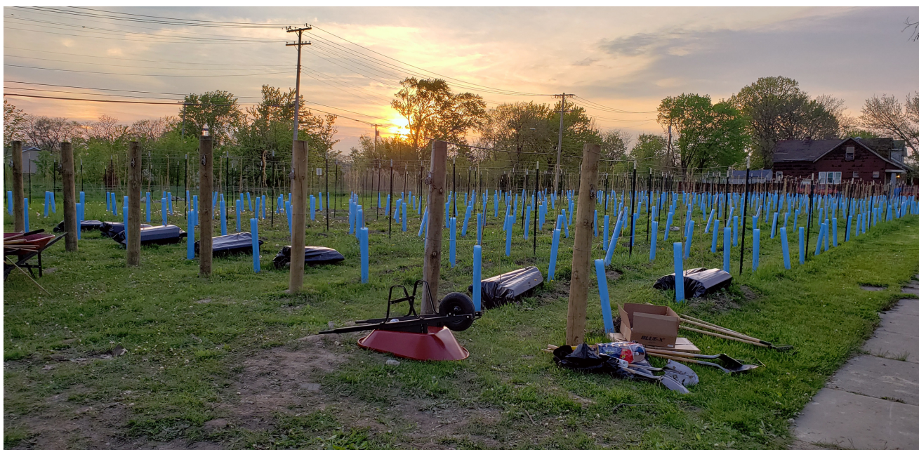
Over 600 vines were planted by community members and Detroit Vineyards to create the Morningside Community Vineyard.