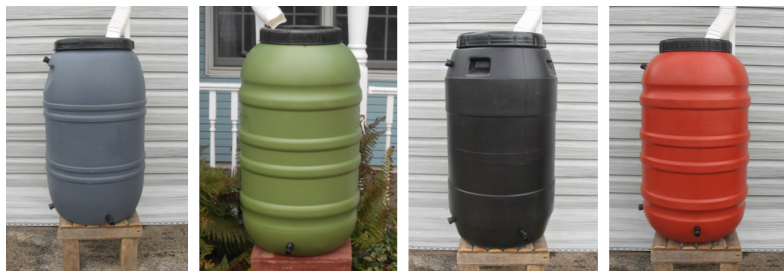
Multi-Color Rain Barrels