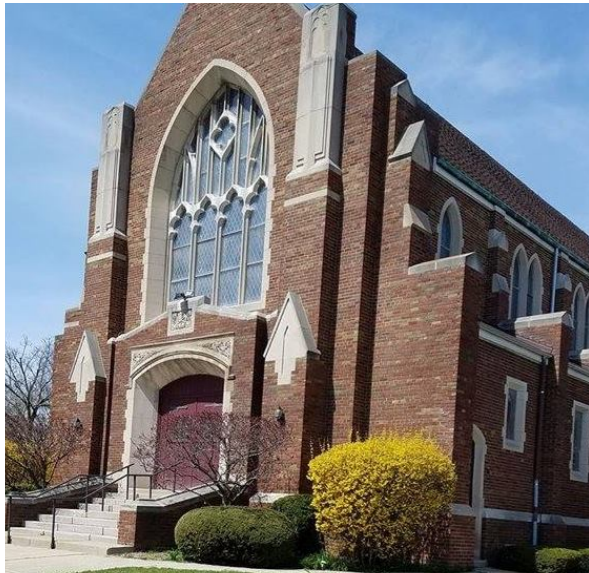
Community Anchor, Bethany Lutheran Church.

The Morningside Community Association would like to take out the time to give a special thanks to one of our biggest community supporters, Bethany Lutheran Church. From being the host of countless events such as our General Community Meetings, to Christmas celebrations over the years and just being a pillar for Morningside and all the surrounding communities, we would not be able to do what we do if it wasn't for Bethany. Please stay up to date with the wide variety of services Bethany provides to the community by following their Facebook page at: Bethany Lutheran-Detroit, and their website: bethanydetroit.org.