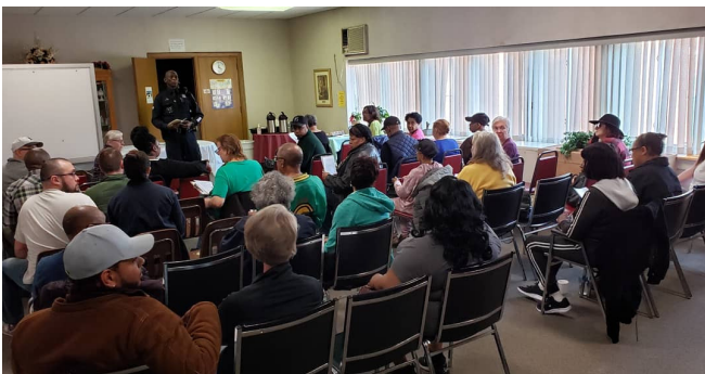
Residents of Morningside attend general community meeting.

Our general community meetings are the first Saturday of every month from 12-2 pm at Bethany Lutheran Church, 11475 E. Outer Drive. If you live in the boundaries of I-94 to Mack Ave., Alter Rd. to E. Outer Drive, you're automatically a member of our great community. We hope to see you soon!