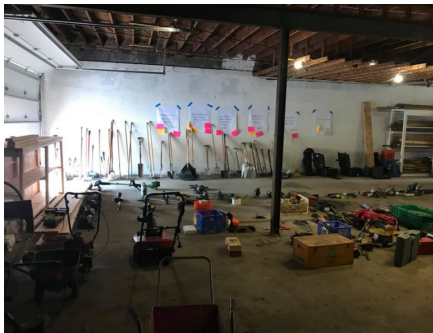
The East Warren Tool Library will be operated by non-profit Motor City Grounds Crew and powered by Restorin' East Warren.