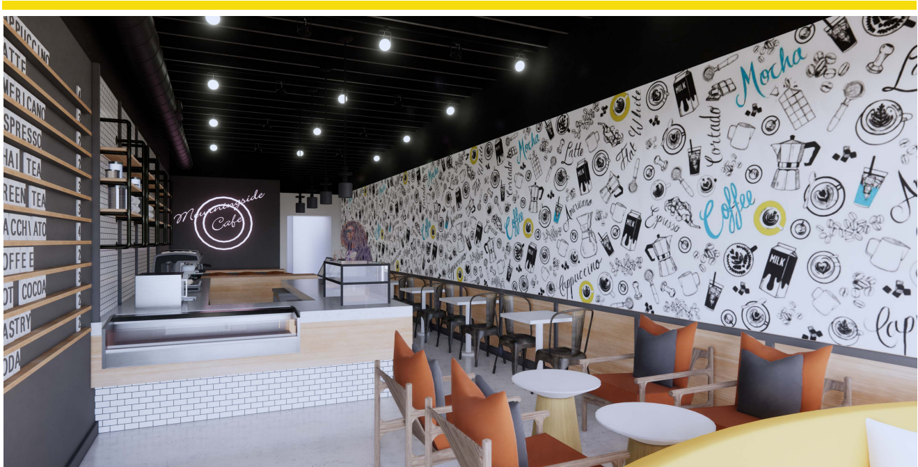
Rendering of Morningside Cafe - coffee, entertainment space coming to East Warren.