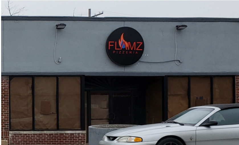
Flamz Pizzeria - woodfired pizza restaurant, the first of its kind for Morningside.

Within just a few short months, the need to travel to downtown Detroit or the outer suburbs for some of your basic needs will diminish greatly. Flamz Pizzeria, a dine-in and carryout restaurant specializing in woodfired style pizza will be opening in a few short weeks at 16369 E. Warren.