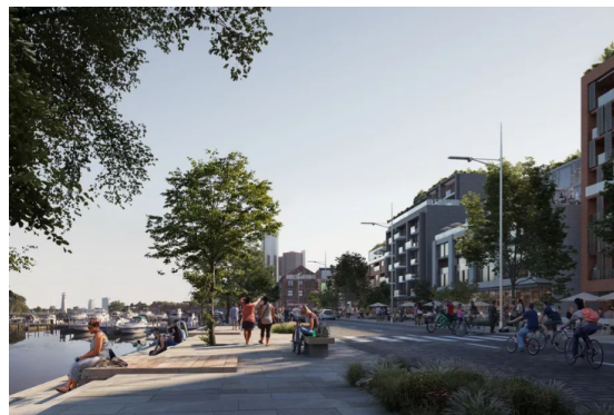
The future Atwater Street—public space on the water, development across the street

The Detroit RiverFront Conservancy says that the State of Michigan is working on a six-acre expansion of Milliken Park, and work will start this fall on extending the bike path along the Uniroyal Site, which will connect the Riverwalk to Belle Isle. Work is expected to start this spring on upgrading the Joseph Campau Greenway, which will make it easier for residents to access the Riverfront.